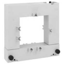
Current transformers DM2TA0800